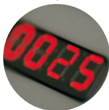
Contacolpi elettronico Electronic dosing counter