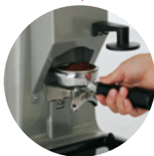
Dosatura automatica Automatic dosing